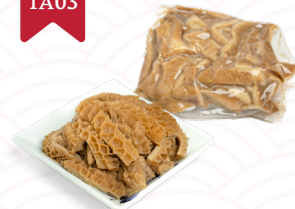
牛肚 Beef Tripe 250g