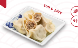
手工牛肉水饺 Handmade Beef Dumplings 6 pcs | 12 pcs