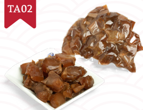
牛筋 Beef Tendon 250g