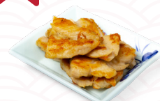
香煎鸡柳 Grilled Chicken