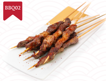
炸羊肉串 Mutton Skewer