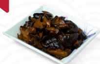
秘制香菇 Braised Mushroom