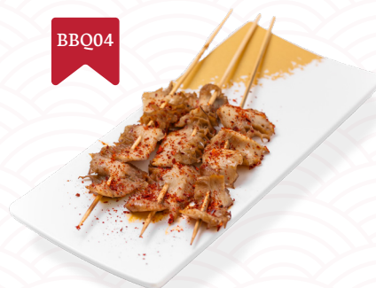
炸牛肚 🍷👍 Beef Tripe