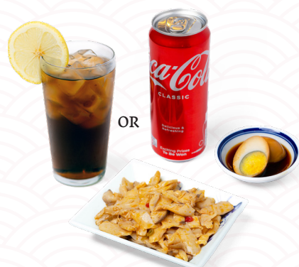
小菜 + 药材卤蛋 + 饮料 Side Dish + Braised Egg + Drink*

*A choice of canned drink or sour plum drink.