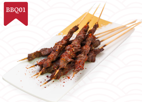
炸牛肉串 🍷👍 Beef Skewer