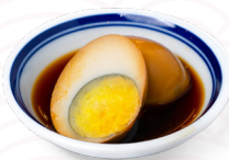
药材卤蛋 Braised Egg

图片仅供参考，菜品以实物为准 Prices are subjected to service charge & prevailing GST