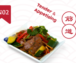
凉拌牛肉 Cold Beef