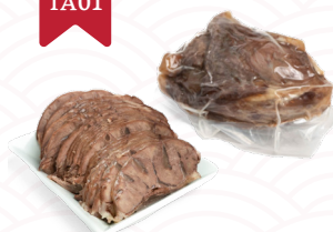
五香牛腱 Spiced Beef Shank 500g