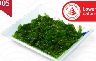
凉拌海带丝 Seasoned Seaweed