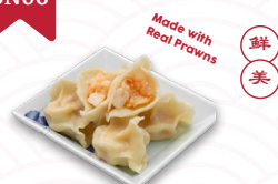
手工虾仁水饺 Handmade Prawn Dumplings 5 pcs | 10 pcs