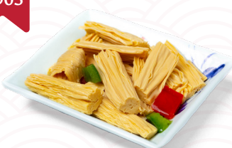
凉拌腐竹 Beancurd Skin