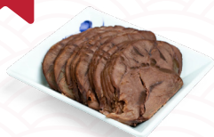
白切牛肉 Sliced Beef 50g | 100g