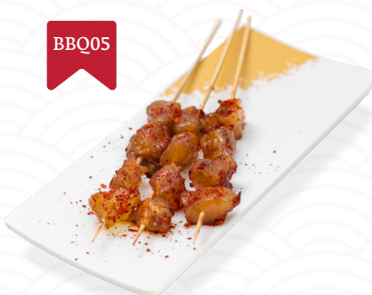
炸牛筋 Beef Tendon