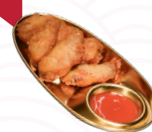
炸鸡翅 Crispy Chicken Wings 3 pcs | 5 pcs