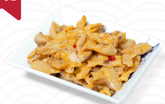
香辣鲍鱼菇 Spicy Oyster Mushroom