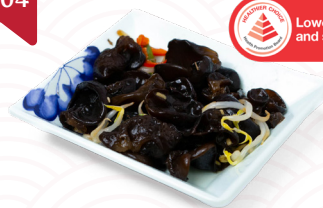
凉拌木耳 Black Fungus