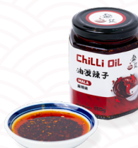
油泼辣子(麻辣) Mala Chilli Oil