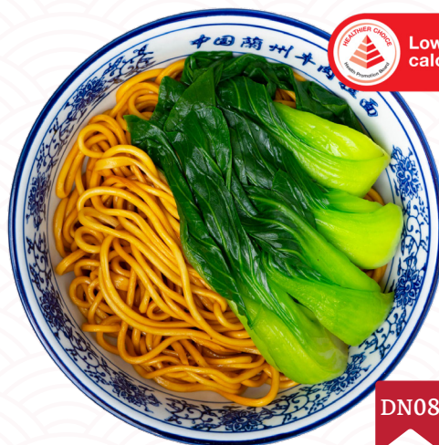
干拌香菇面 🌿 Dry Mushroom Noodles (S) | (L)