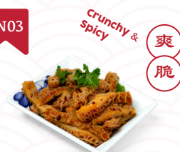
麻辣牛肚 Mala Beef Tripes