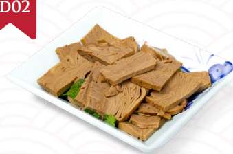
凉拌素鸡 Beancurd Suji