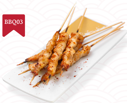
炸鸡肉串 🍷 Chicken Skewer