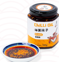
油泼辣子(香辣) Classic Chilli Oil